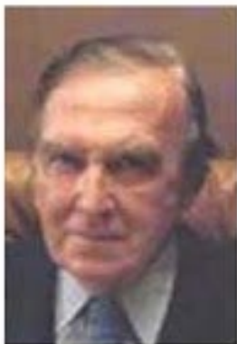
Sir John Buchan

We pay tribute to the Founders of Apex and whilst they have passed from us, their ideals will never be forgotten: