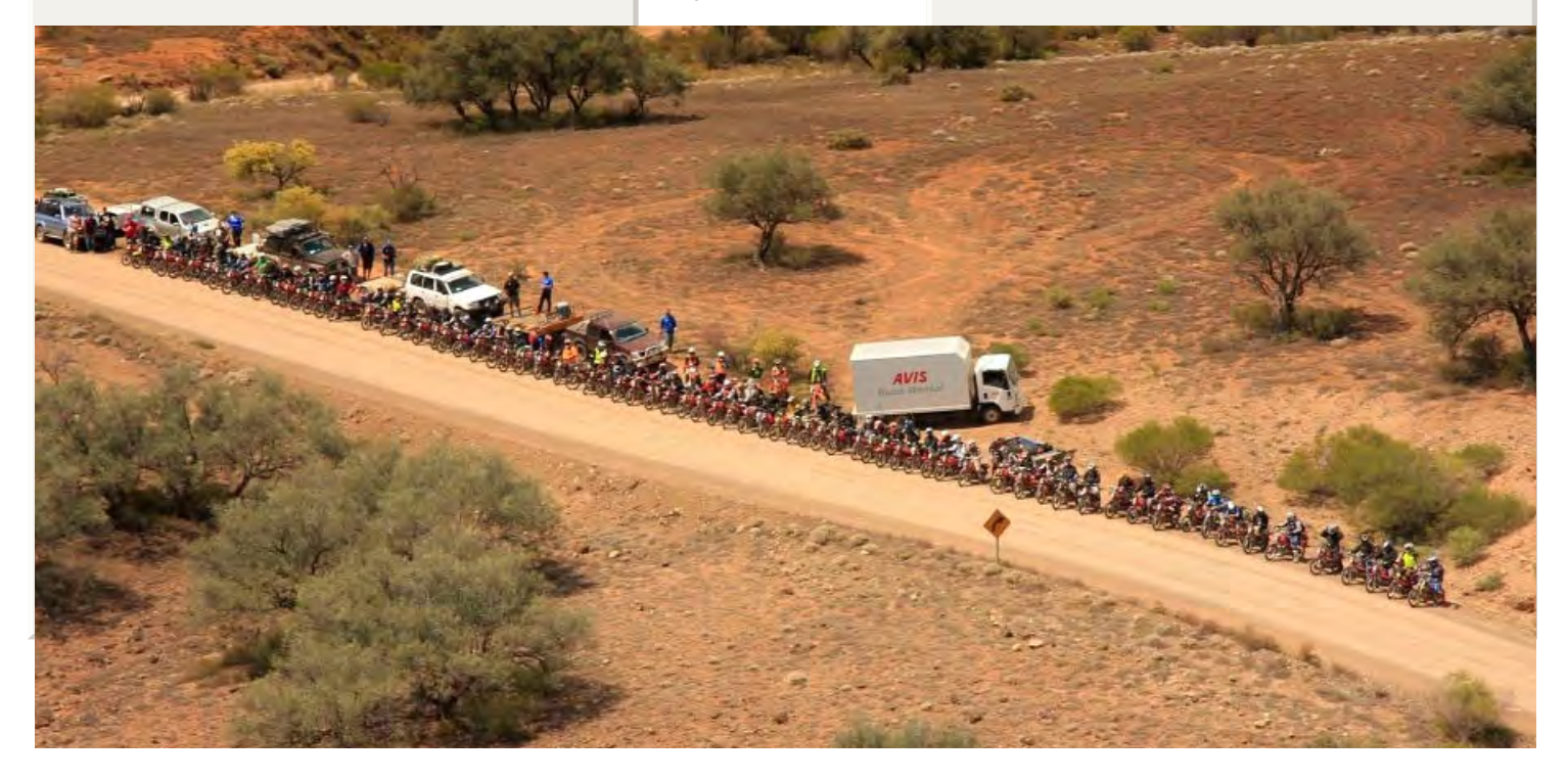
Your Apex New Member's Information Kit