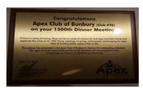
Apex Club of Bunbury - 1500th Dinner Meeting Plaque

in dividuals building a better community. Have a look at the resources section of our website, apex.org.au for full details of their achievements.