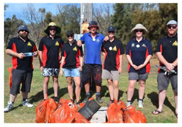
Club members at the park cleanup