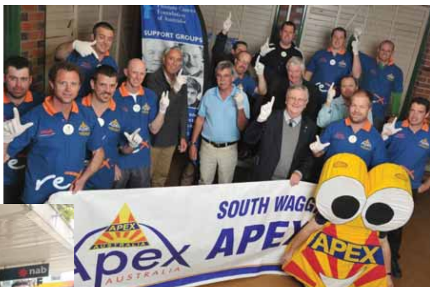
Pictured above right Apex South Wagga at the first ever Biggest Blokes Lunch, above club members and their families at the Anzac Day flag project, and at right are the billy lids at the Father-Kids Camp