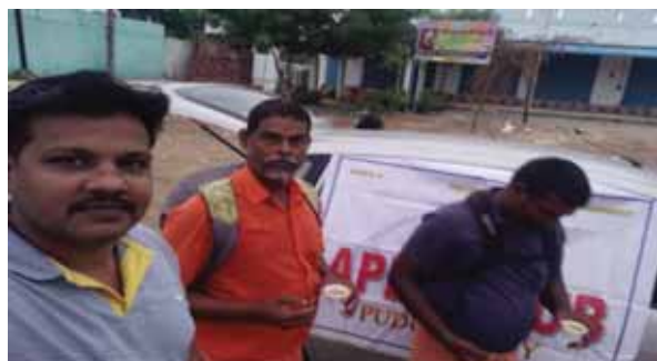
Distribution of Tea and Biscuits by Apex Pondicherry

Apex Namakkal has extended financial assistance towards Medical Rs 3000/-, educational Rs. 5000/- and sports activity Rs 5000/- locally to deserving candidates.