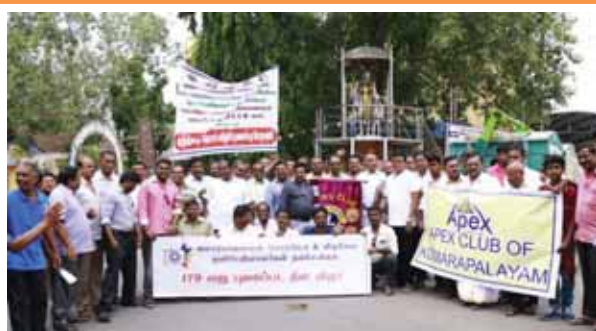
Diabetes Awareness March – Apex KPM

Some examples of Apex India club projects.