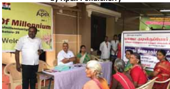
Free Medical Camp – Apex Millennium