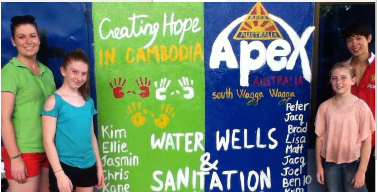
Your Apex New Member's Information Kit