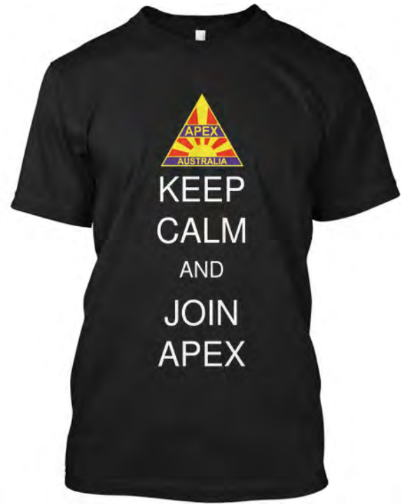
Clockwise, from above. Setting up at the world famous Camel Cup, organised by Apex in Alice Springs., Shirts organised by Ross River club in North Qld, new members joining Caboolture, the Gympie Music Muster, put on by Gympie Apex Club.