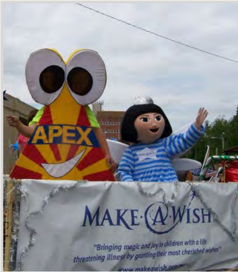
Clockwise from left