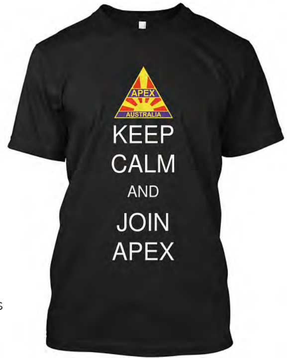
Clockwise, from above. Setting up at the world famous Camel Cup, organised by Apex in Alice Springs., Shirts organised by Ross River club in North Qld, new members joining Caboolture, the Gympie Music Muster, put on by Gympie Apex Club.